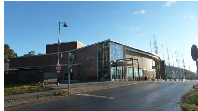
Oulu Swimming Pool