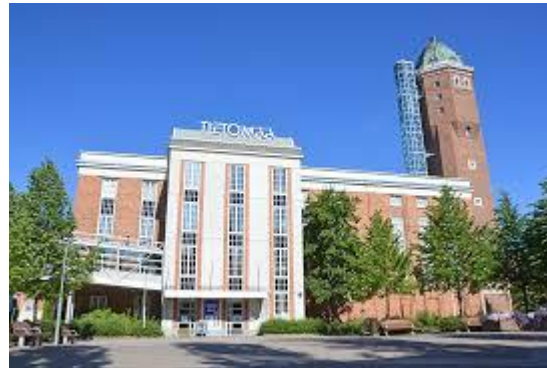
Science Centre Tietomaa