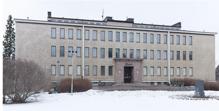
Northern Ostrobothnia Museum