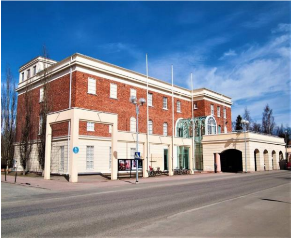
Oulu Museum of Art